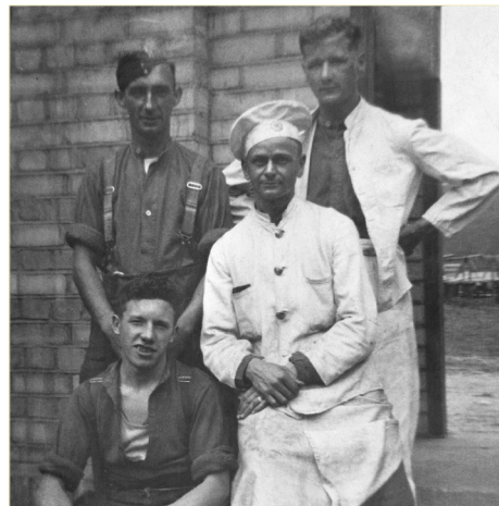
Learn more about their lives by exploring 1940 census documents.

This census illustrates the changing world Americans were facing in 1940. World War II had begun the previous September abroad and the shifting boundaries of nations in Europe and Asia could result in potentially erroneous answers to the question "place of birth." The solution for those of foreign birth was to "give country in which birthplace was situated on Jan. 1, 1937." Also